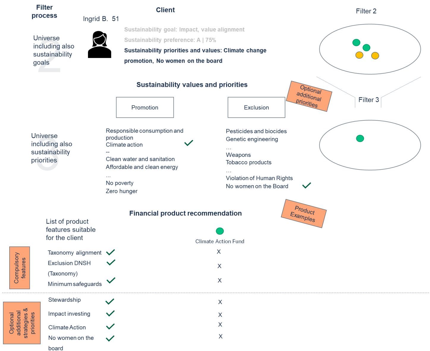
Example: Sustainability assessment long route