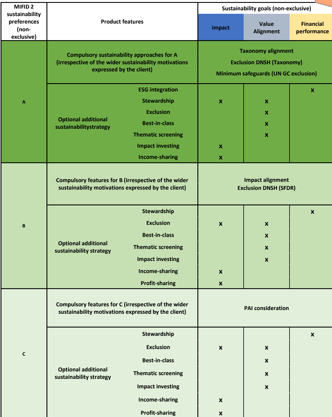
Table 3: Draft matching table between compulsory and optional additional product features and sustainability goals:

X = to a great extent suitable sustainability strategy for the sustainability goal